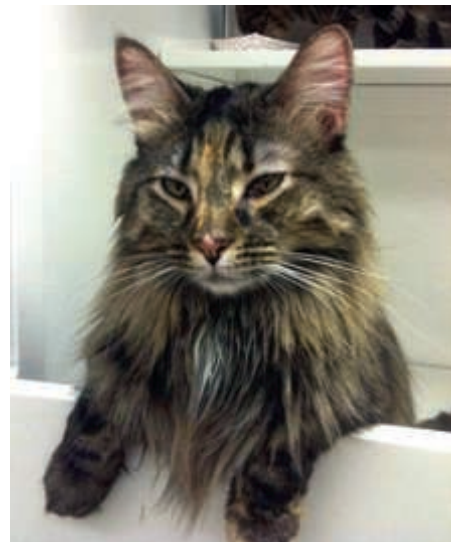
"Just HOW good looking do you have to be to get adopted in this town?"