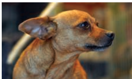
Lulu's a lover, that's for sure

Anyone wanting to help with the cost of her treatment please let us know. As always, thank you for all your help.