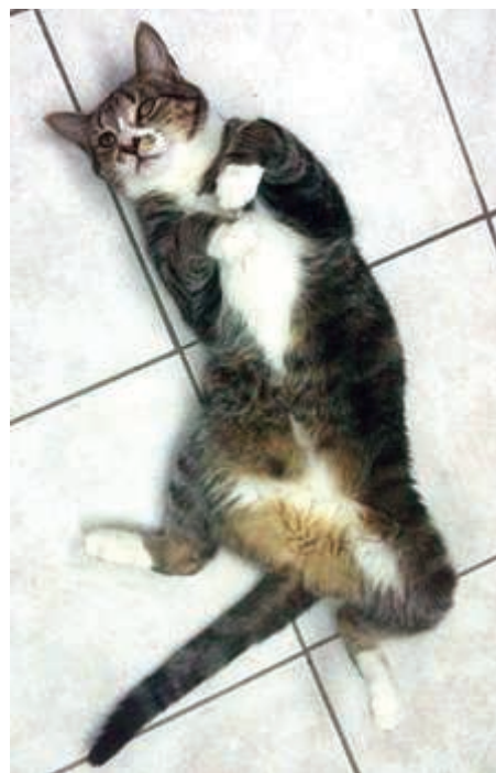
"This is my best pose - I call it the Adoption Special With A Half Twist"