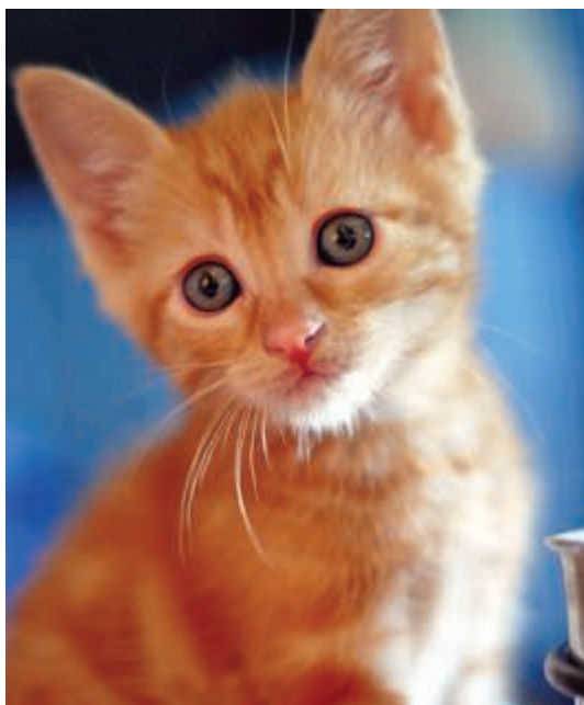
I Need A Foster Parent...

We're already out of fosters. If you want to foster a litter of kittens please call us - without fosters we cannot take kittens in, and most will die. We can supply you with a large cage, food and vet care. Fosters will have to keep them for at least 3 months, so you have to commit to that amount of time in order to foster.