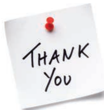
This little guy thanks you too

Adopt A Cat Foundation, Inc. is a 501 (c) 3 organization. Gifts are tax deductible as a charitable contribution to the extent allowed by law